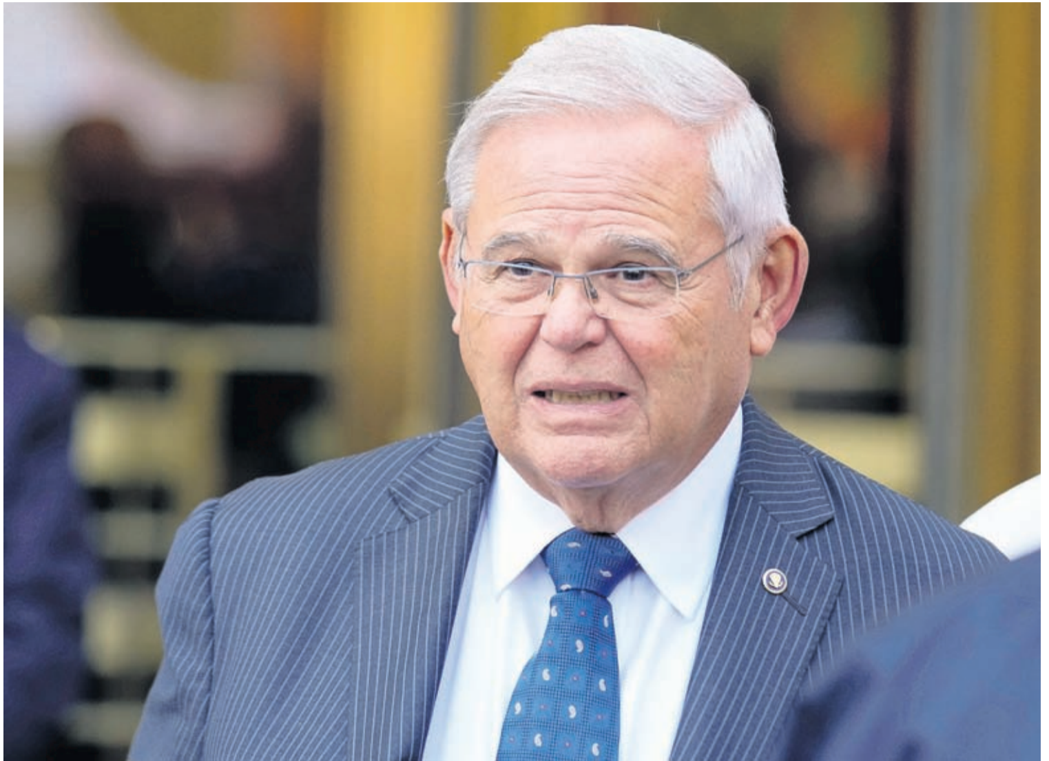
Continued on Page 2 Sen. Bob Menendez leaves federal court, Wednesday, Sept. 27, 2023, in New York.